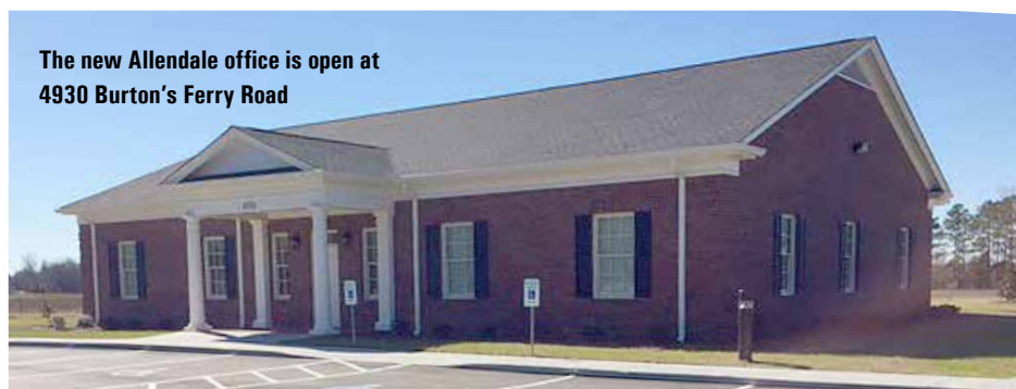
The new Allendale office is open at 4930 Burton's Ferry Road